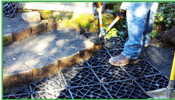
Mud Free with EcoGreenGrid